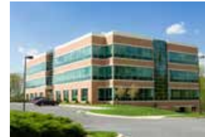
Facilities Management/Maintenance Services