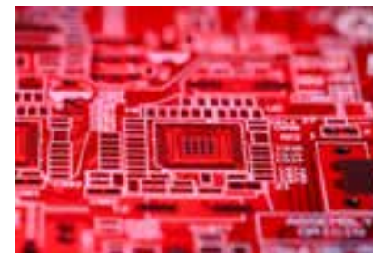
Information Technology Services