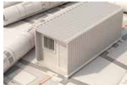
Modular Facilities Support Services