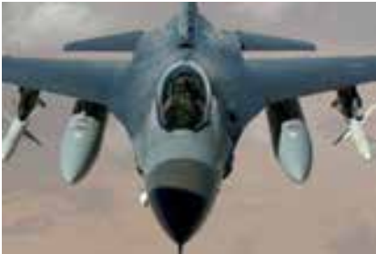
Aviation/ Engineering Services